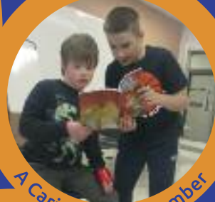
A Caring Family Member