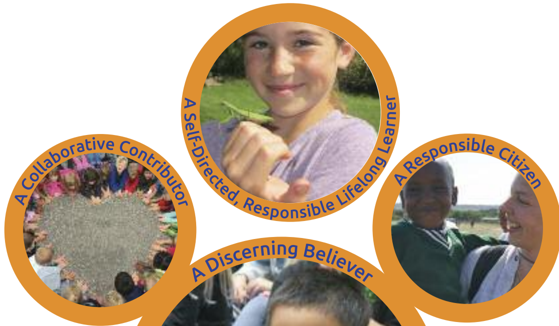
A Discerning Believer